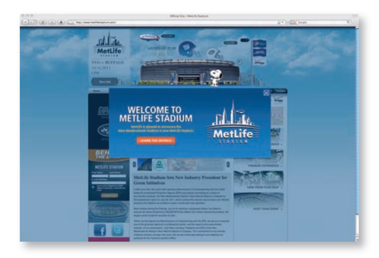
MetLife's deal for the home stadium of the New York Giants and the New York Jets exemplifies the way that value is justified through traditional brand valuation methodologies

faceted, strategic brand-building strategies. The Manchester City/Etihad deal and MetLife's deal for the home stadium of the New York Giants and the New York Jets deals exemplify the changes in deal structure and how value is justified through traditional brand valuation methodologies.